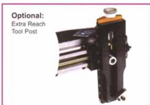
Optional: Extra Reach Tool Post

The Silk AX 2872 is constructed, as the rest of the range, from the highest quality materials. It is designed to give machine shop accuracy, combined with ease of handling and portability in the flange range of 711mm (28") to 1829mm (72"). Spur gears engage directly on the drive ring, keeping power requirements and losses to a minimum and allowing maximum torque at the cutting tool. When the machine is used in the vertical plane, balancing is greatly reduced.